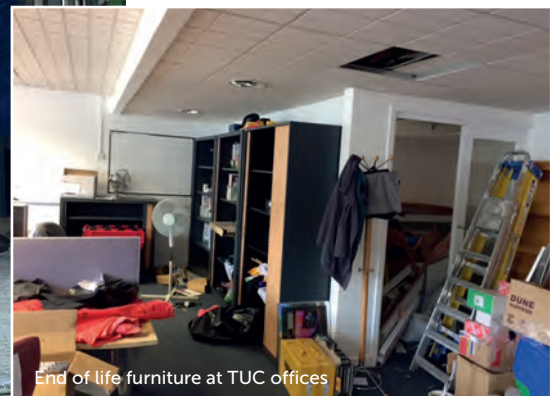
End of life furniture at TUC offices