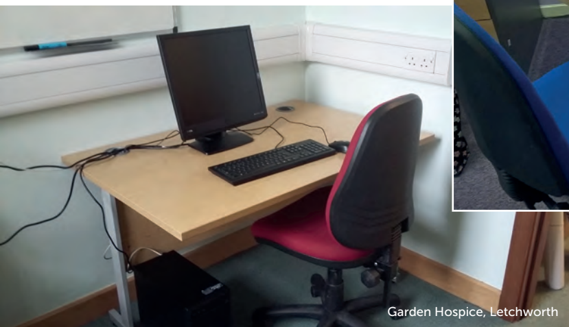
Garden Hospice, Letchworth