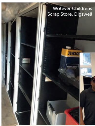
Wotever Childrens Scrap Store, Digswell