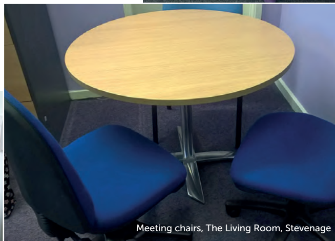
Meeting chairs, The Living Room, Stevenage