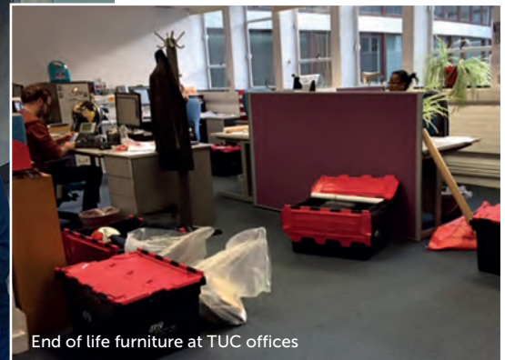
End of life furniture at TUC offices