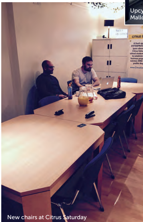
New chairs at Citrus Saturday

"Citrus Saturday is an enterprise skills programme for school kids run by university volunteers and we desperately needed some new chairs for our training facility. JPA kindly provided 10 excellent stackable chairs for our volunteers to use and now we can sit comfortably during our training and mentoring sessions! We use them a lot and it's made a real difference as we don't have any budget for furniture, focusing all our fundraising efforts on raising money to deliver the activity of the programme in schools and youth clubs. Many thanks indeed TUC"