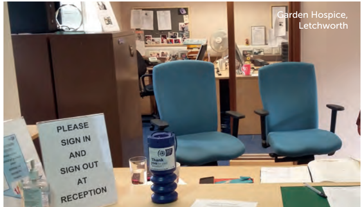
Garden Hospice, Letchworth