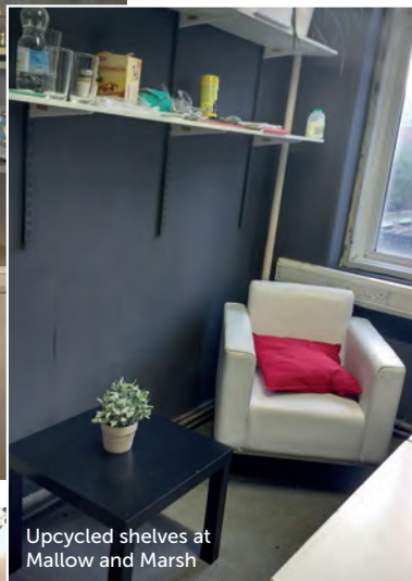
Upcycled shelves at Mallow and Marsh